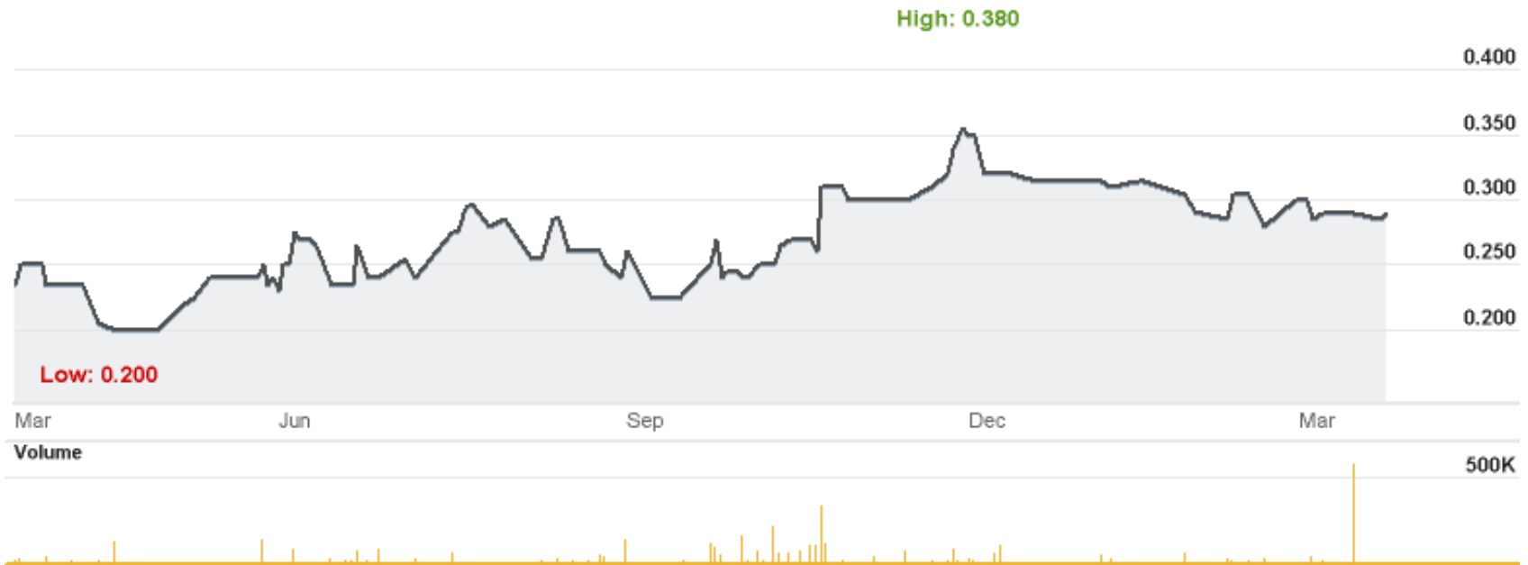
CGS share price graph